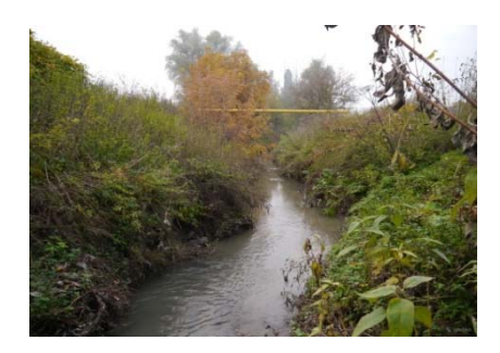
Pic. 1. Nyvka river

II. The main watercourse of Irpin river (from the place of confluence of Nyvka river to the mouth) – right tributary of Dnipro river (pic. 2).