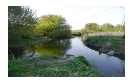
Pic. 2. The place of confluence of Nyvka river (on the right) into Irpin river (on the left)

II. The main watercourse of Irpin river (from the place of confluence of Nyvka river to the mouth) – right tributary of Dnipro river (pic. 2).