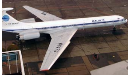
Fig.4. Aircraft Ilyushin - 62 with single vortex generator on the wings

long-term operation despite of the fact that the single vortex generator was applied at the leading edge of the airplane.