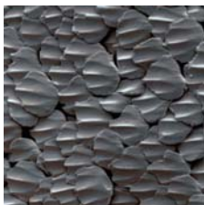
Fig.1. Shark skin structure

The main disadvantages of artificial vortex generation technology include the additional energy losses associated with vortex generation, which significantly limits the possibility of its practical application. However, it is known some natural examples of streamlined surface vortex generators implementation. One of the most obvious is the complicated geometry of the shark skin (Fig.1). In addition, the technology of artificial vortex generation is regularly used in aviation. For example, a single vortex generator can be mounted on engine nacelles (Fig.2), as well as a system of small vortex generators is mounted on the wing upper surface of an airplane Boeing 737.