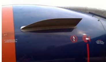
Fig.2. Vortex generators mounted on engine nacelles

The vortex generation of modified geometry leading edge has a natural realization on the fins of humpback whales (Fig.3). This allows for the whale fins to remain effective during sudden maneuvers, and accordingly, at high angles of attack. From a technical point of view, this modification of the leading edge may be considered as intelligent vortex generator, since it is free of the total lack of vortex generators associated with the inevitable loss of energy. This type of vortex generation practically does not change the aerodynamic characteristics at the operational range of angles of attack. But it will be effective only for angles of attack at which flow separation occurs for airfoils without modification of the leading edge. This property has been studied in detail in the design of the wing of the Soviet Union aircraft Ilyushin - 62 (Fig.4) and confirmed its performance by its