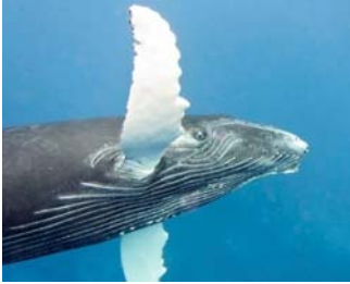
Fig.3. Fins of humpback whale